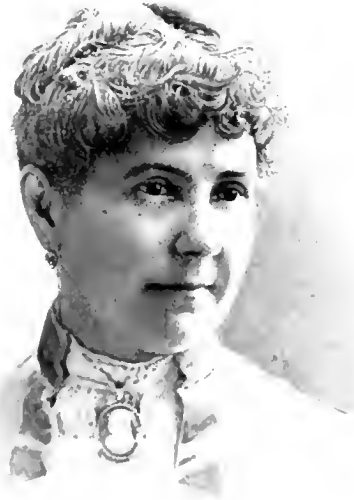
SARAH KNOWLES BOLTON.

appeared in the "Waverly Magazine," when she was fifteen years old. Soon after her graduation she published a small volume, "Orlean Lamar and Other Poems" (New York, 1863), and a serial was